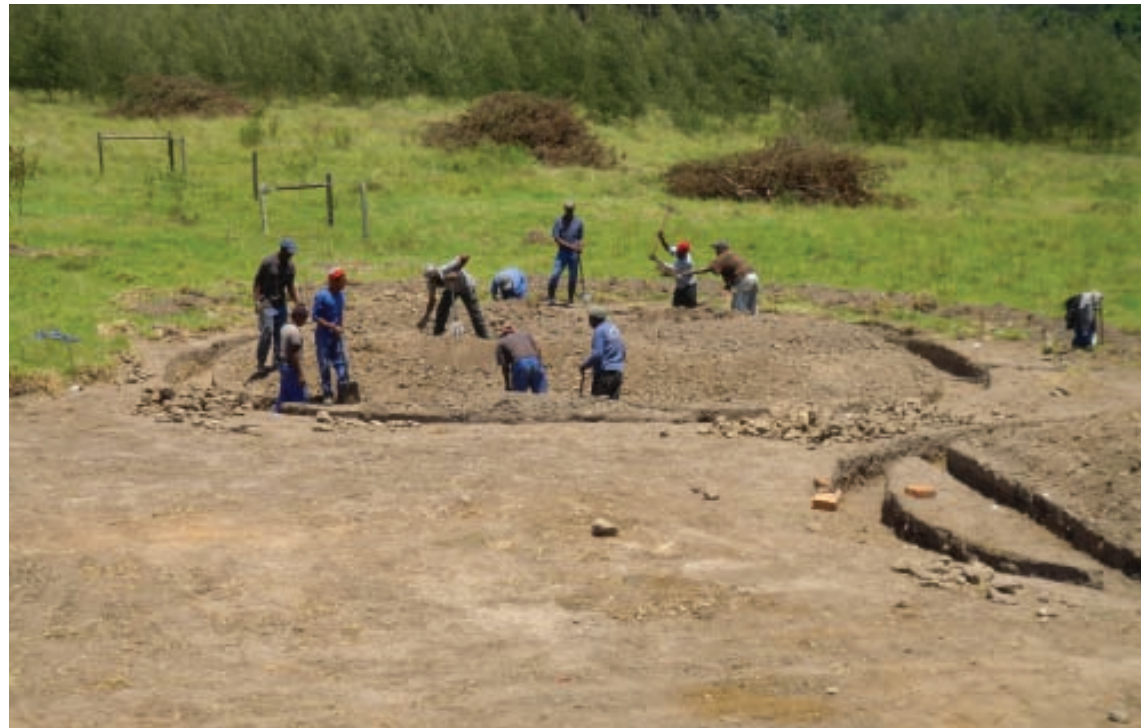
LOCAL WORKERS DIG THE FOUNDATIONS BY HAND AS THEY BEGIN CONSTRUCTION ON THE FIRST THREE COTTAGES

Ground is broken! Due to the success of A LONG WALK FOR CHILDREN , we are set to start construction on three of the six cottages that will be built over the next two years. Each cottage will house 6-8 children in addition to a housemother. When all six cottages are complete, we will be able to provide a home filled with love to 50 additional children. We are so grateful to all our donors who have made this growth possible. On behalf of the current and future residents of Open Arms, we thank you from the bottom of our hearts!